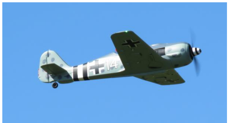
Jim Hornung E-flite FW-190A