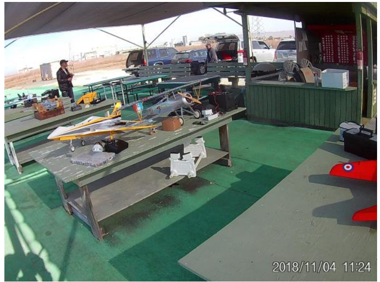
Robert's two eras of flight—Avanti and Maxford Nieuport 17

SACRC Xmas dinner December 8 at Oakland Aviation Museum, 8252 Earhart Rd. Oakland, CA at 7:00PM. Club supplies turkey, ham and soft drinks—members supply side dishes, desserts and their own wine or beer.