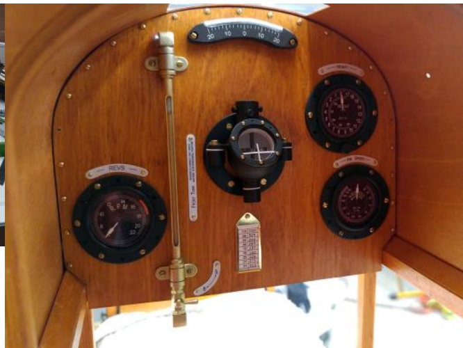
All of the wood parts were cut using jigs/templates and a standard router. The instrument bezels were 3D printed. The builder is doing a fantastic job!