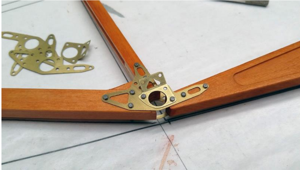
On RCScaleBuilder.com—a 1/4 scale RAF BE2C. Fittings were photo-etched!