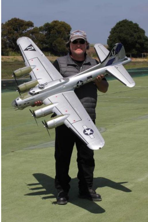
Lawrence's Hobby King B-17