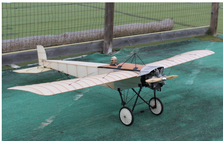
Bob Stutsman's Sommer Monoplane—a wing warper—no ailerons!