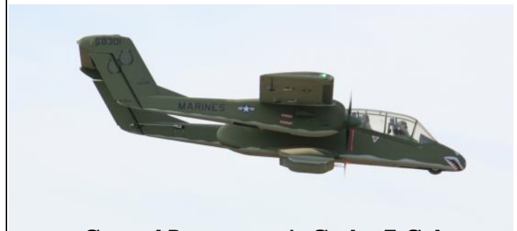
Conrad Bustamante's Carbo Z-Cub