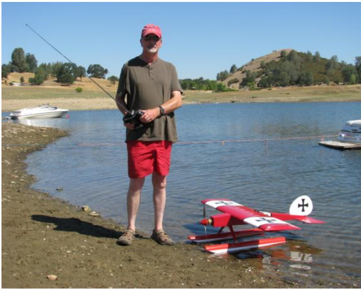
Hogan Lake float fly—Great time