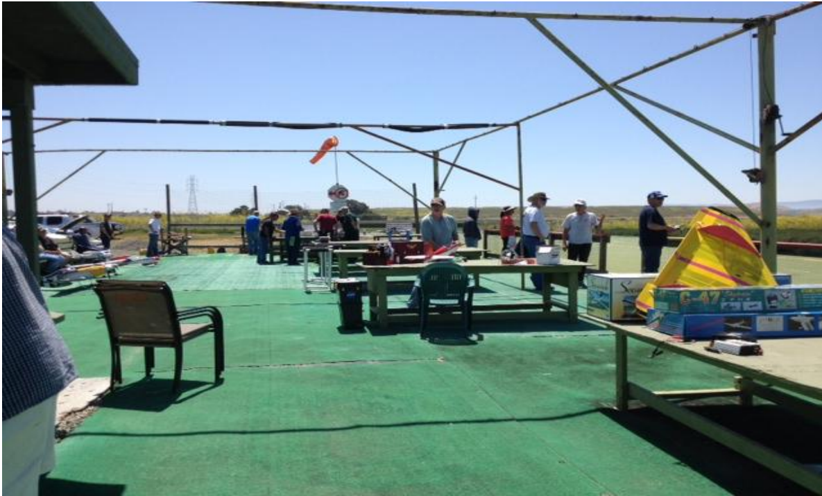
Having fun flying after the meeting