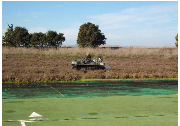
It's that time of the year....again Mosquito spraying will be done by Alameda Co. Workers....Fly safely when he is near the Field.