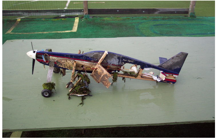
Jim Solar's Mystery Ship I actually met the duck hunter that removed this from the pond and placed it on the levy Small World