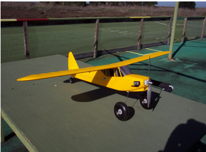
Scott Clinton's Multiplex Cub.....it will be a float plane