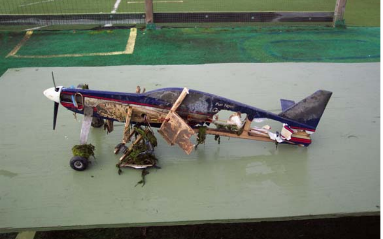
The Field on New Year's Day Unfortunately, Mother Nature didn't cooperate To start the year off with a flight