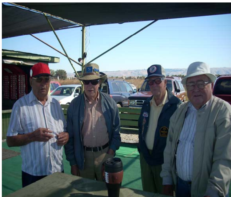
Some of the Weekday flyers