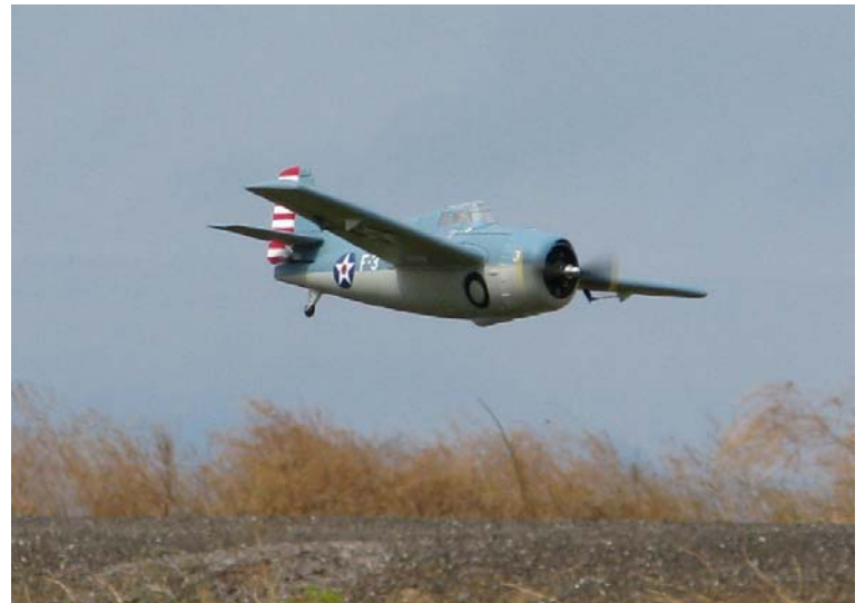
Scott's Parkzone F4F Wildcat