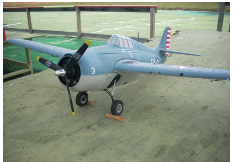
Art Vargas's upgraded F4F Wildcat