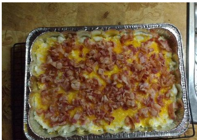
My Cheesy Bacon Mashed Potatoes

Since the December meeting is the club Christmas dinner there was no official business conducted. We do have some pictures to share with you however: