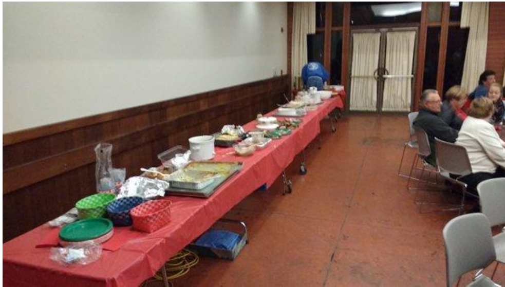
Why we came!