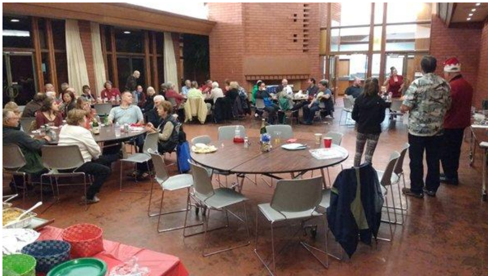
From the other end