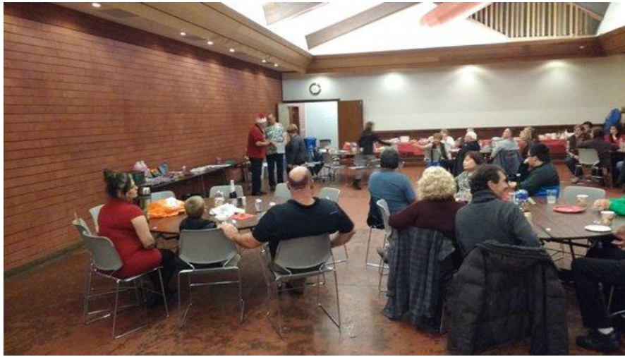
A better view of the facility