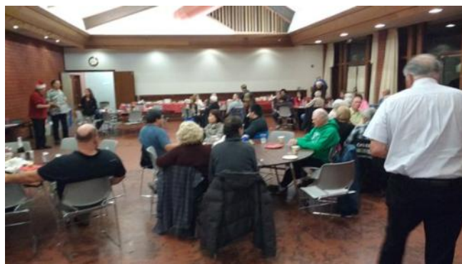
Overall look at the facility