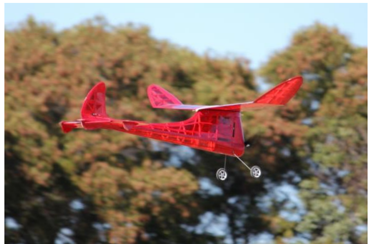
Bob's Old Timer