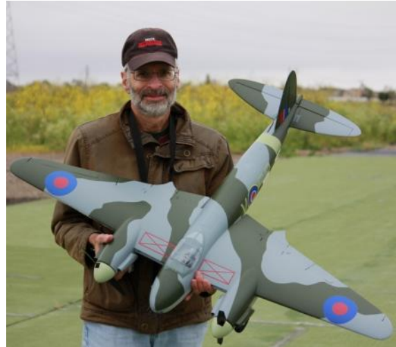
Burt's new Parkzone Mosquito