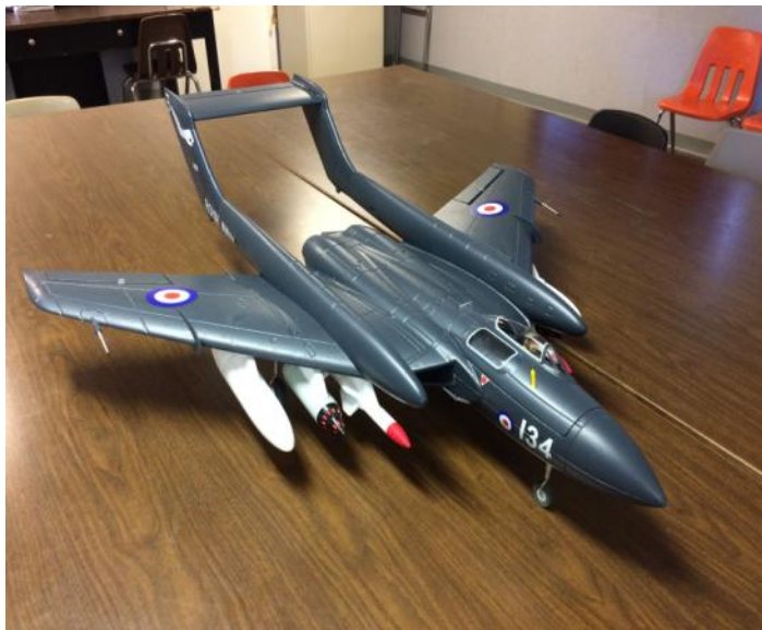
Our gifted Photographer Burt Rosensweig shot Norm's Sea Vixen at the meeting