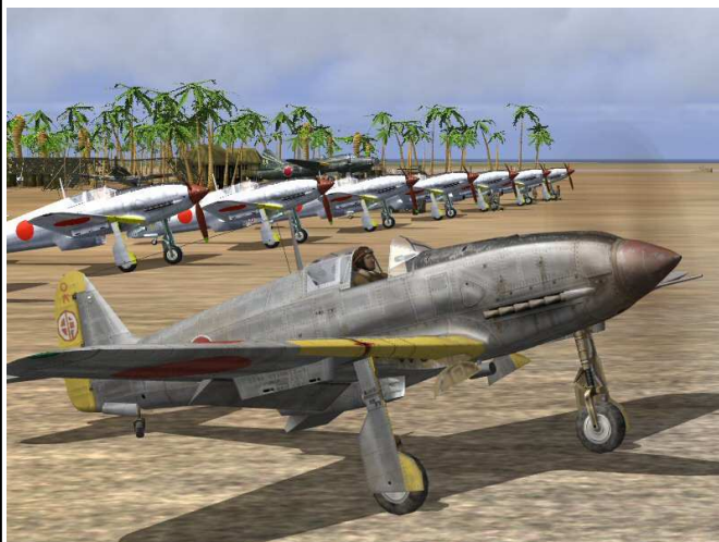
Artist's rendering of a Ki-61 "Hein"

Meeting adjourned to the raffle at 8:45 PM