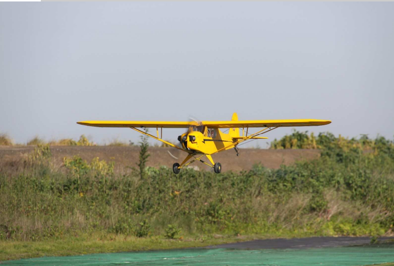
Lane Davidson's H9 Cub